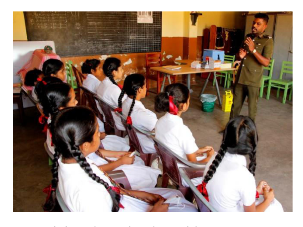
Oragnizing the School Health Programme