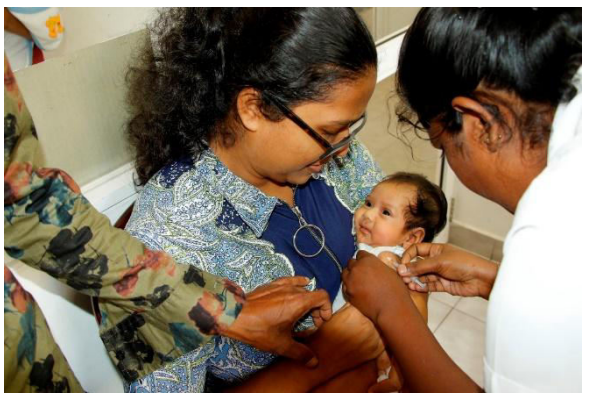
Registration and updating immunization records